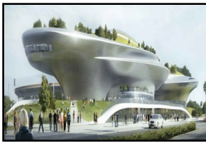
Rendering courtesy of LADCP

On October 26, 2018, a permit was issued to Lucas Real Estate Holdings, Ltd. for the Lucas Museum of Narrative Art (LMNA) located at 3800 South Vermont Avenue. The project will feature a five-story, 110 foot tall building with 300,000 square