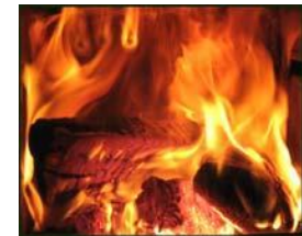
EPA Wood Heater Program

Enclosed is the list of wood heaters certified by the United States Environmental Protection Agency (EPA) as meeting the 1988 Standards of Performance for New Residential Wood Heaters. The EPA Certified Wood Heaters list contains the manufacturer's name, model name, emission rate (g/hr), heat output (btu/hr), efficiency (actual measured and estimated), and type of appliance of wood heaters approved by the EPA for sale in the United States. It also indicates whether the appliance is still being manufactured. An EPA certified wood heaters has been independently tested by an accredited laboratory to determine if it meets the particulate emissions limit of 7.5* grams per hour for non-catalytic wood heaters and 4.1* grams per hour for catalytic wood heaters. All EPA certified wood heaters that are offered or advertised for sale in the United States are subject to the 1988 New Source Performance Standard (NSPS) for New Residential Wood Heaters under the Clean Air Act and are required to meet these emission limits.